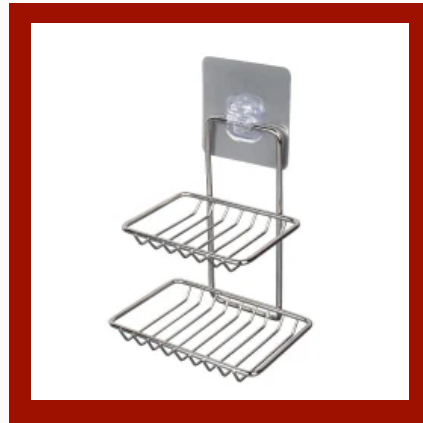
2 Layer Steel Soap Rack