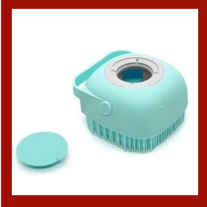
Silicone Body Bath Scrubber