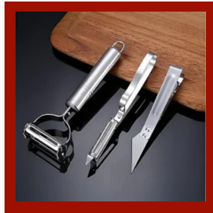
3 in 1 Julienne Peeler