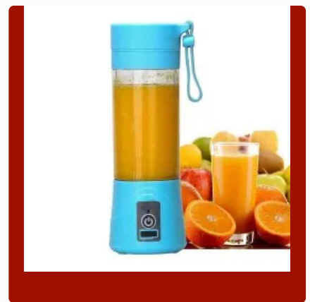
Portable USB Juicer Blender Bottle 4 Blade, 6 Blade