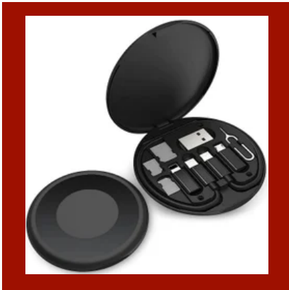
3 In 1 USB Data Cable Set 2.4A 1.5m Black And White Round