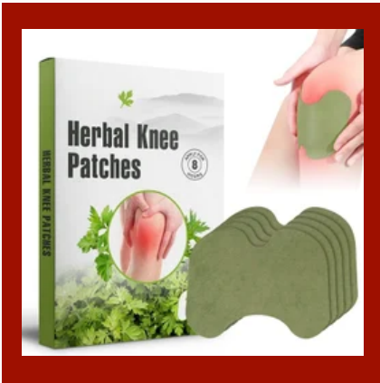
Herbal Knee Pain Relief Patch