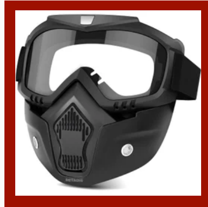
Goggle Bike Face Mask Transperent