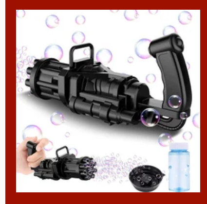
Bubble Gun Toy For Kids