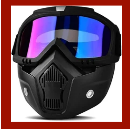
Rainbow Motorcycle Eye Protection and Face Mask