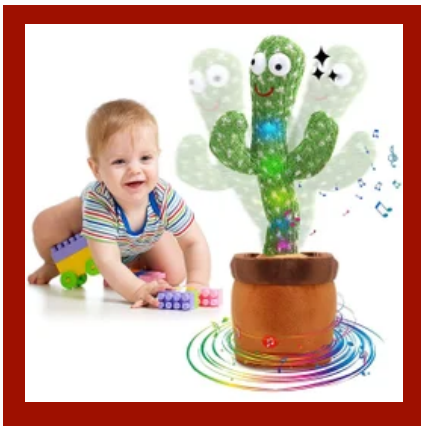
Dancing Cactus Talking Toy