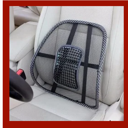
Car Seat Backrest Lumbar Support