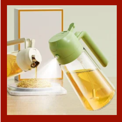
2 in 1 Glass Oil Sprayer and Dispenser