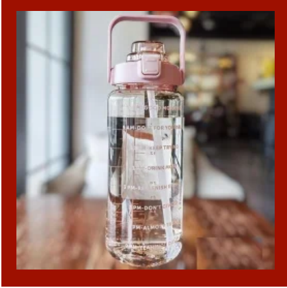
Water Bottle 2 Liter Transperent