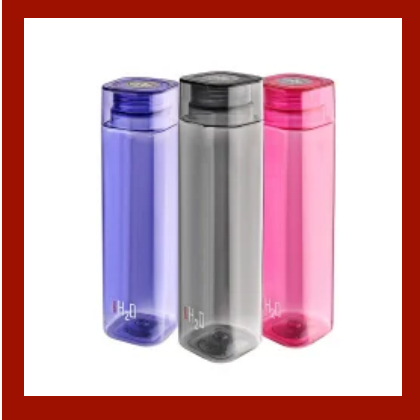
SQUIRE H2O WATER BOTTLE