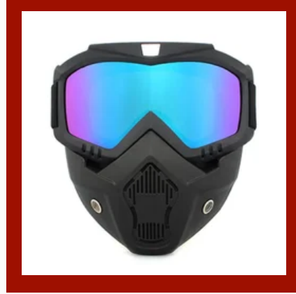
Bike Face Mask Rainbow Colour