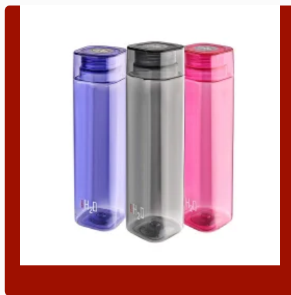
SQURE H2O WATER BOTTLE