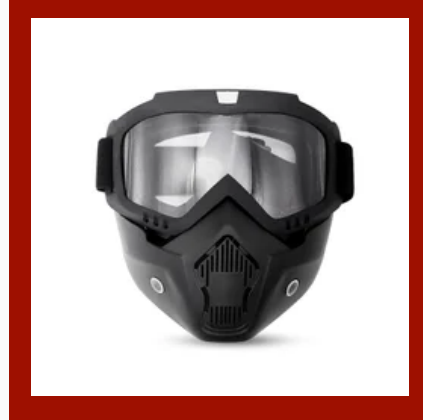
Bike Riding Face Mask