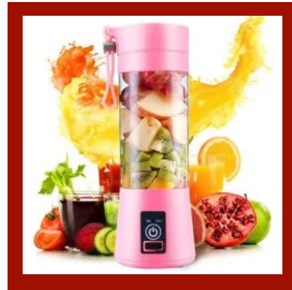
4 Blade 2 USB Juicer Bottle, Electric Portable USB Juicer Bottle Blender