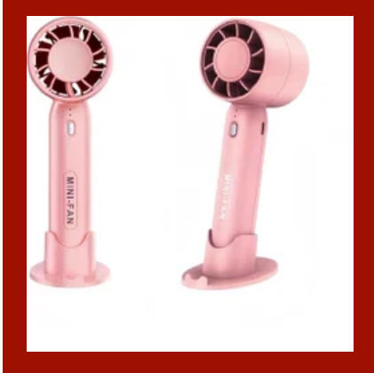
Rechargeable T-10 Handheld Mini Fan With Detachable Base