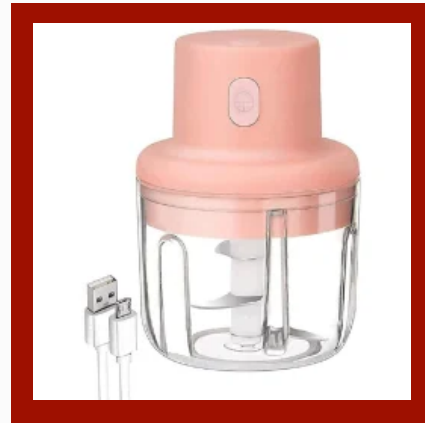
Mini Garlic Chopper