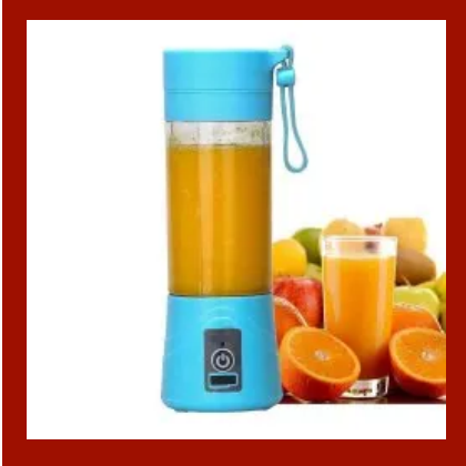
Portable USB Juicer Blender Bottle 4 Blade, 6 Blade