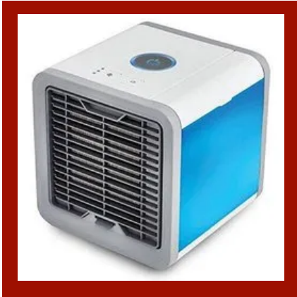
Mini Portable Usb Air Cooler