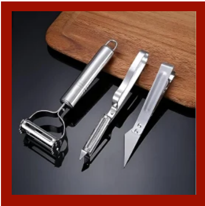
3 in 1 Vegetable And Fruit Peeler