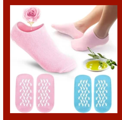
Spa Gel Socks