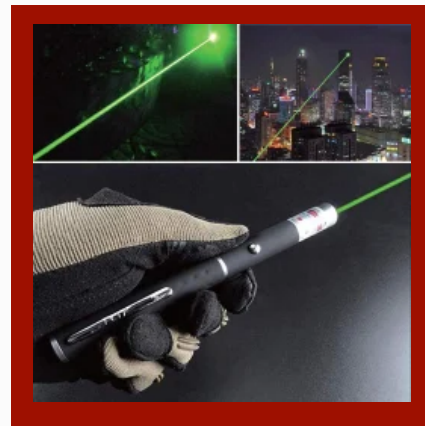
Green Laser Light