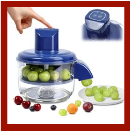
Multipurpose Automatic Fruit & Vegetable Peeler