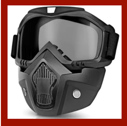
Bike Face Mask Black