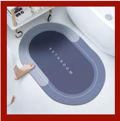
Water Absorbent Mat , Bathroom Mat