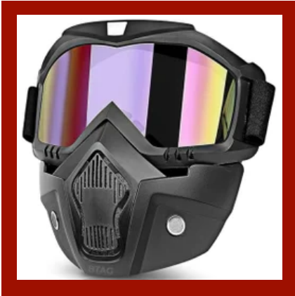
Bike Goggle Face Mask Rainbow