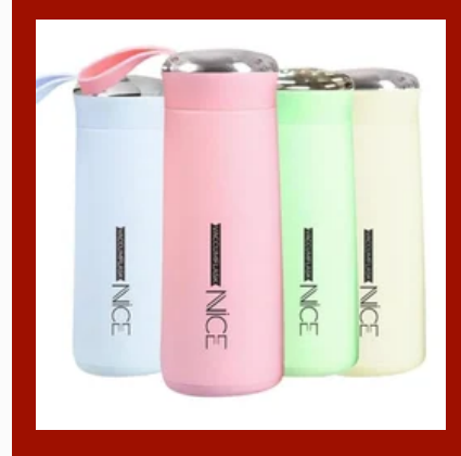
Nice Water Bottle