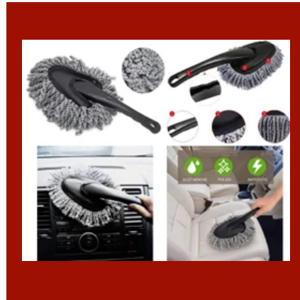
Mini Car Duster