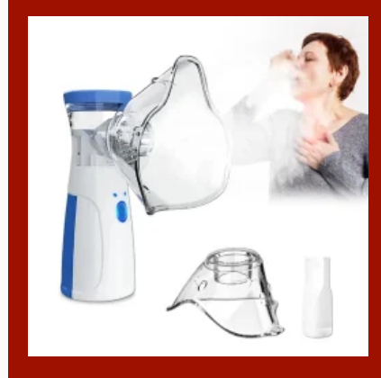
Mini Portable Mesh Nebulizer